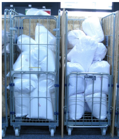
Detail - marking plate