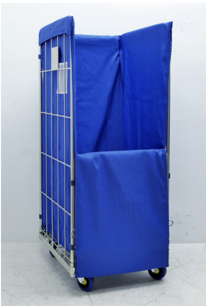
Detail - Cover