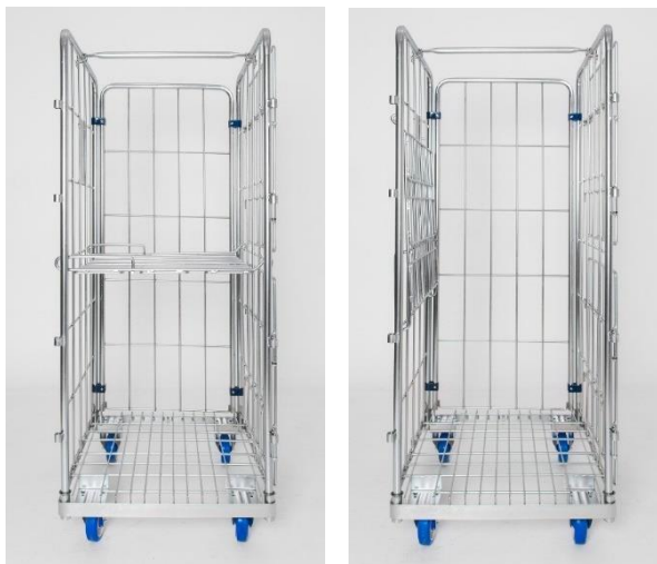
Detail A – Retractable tray